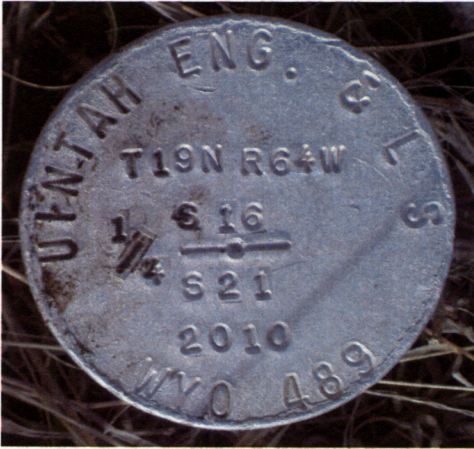
FOUND: ALUMINUM CAP, PLS 489